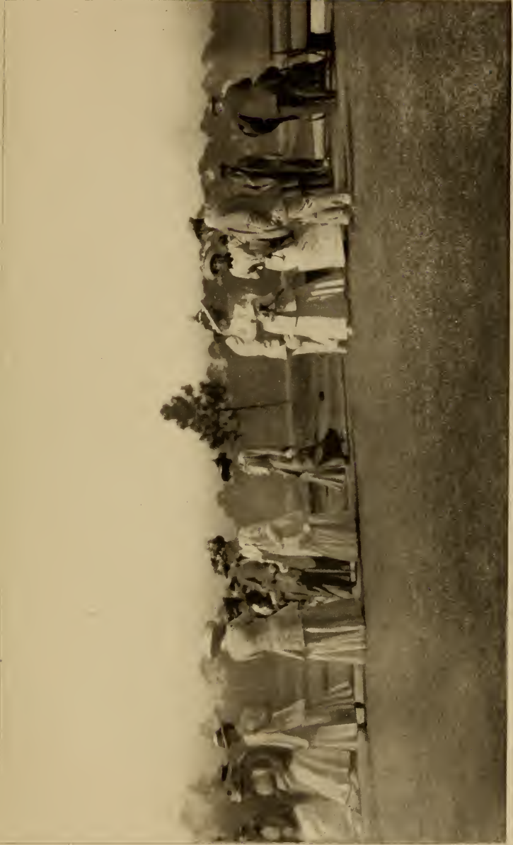
NEW GOLF COURSE